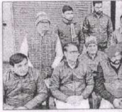
आदेश के बारे में बताते संघर्ष सचिवालय के सदस्य

यमुनानगर। हरियाणा सरकार के दादूपुर-नलवी नहर को डी-नोटिफाई करने के आदेशों व बनाए गए कानून 101ए को असंवैधानिक करार देते हुए हरियाणा एवं पंजाब उच्च न्यायालय ने निरस्त कर दिया है। हाईकोर्ट की डबल बेंच वाली पीठ के इस आदेश से किसानों को खेती का मुआवजा मिलने में